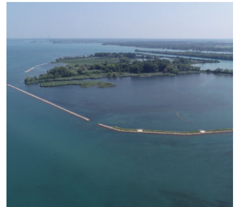
Detroit River Stony Island Habitat Restoration