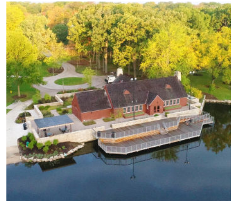
Lake Ellyn, IL Park Master Plan & Boathouse