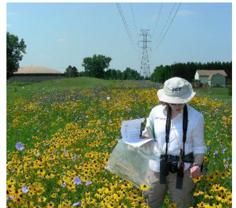
Transmission corridor natural area planning