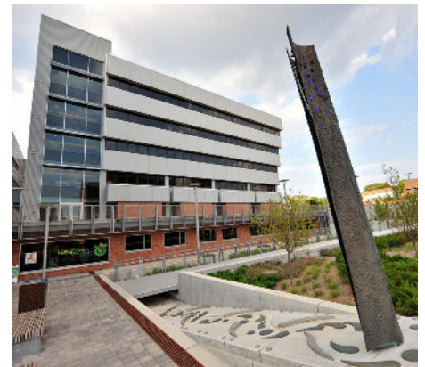
Ann Arbor Municipal Center