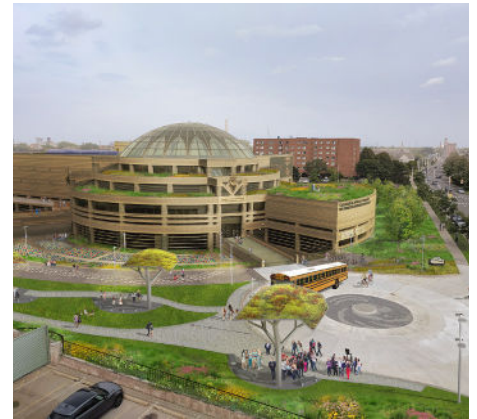
Charles H. Wright Museum Green Campus Plan

Wildlife Habitat Council Green Infrastructure Project Award Iowa City Warehouse, IA